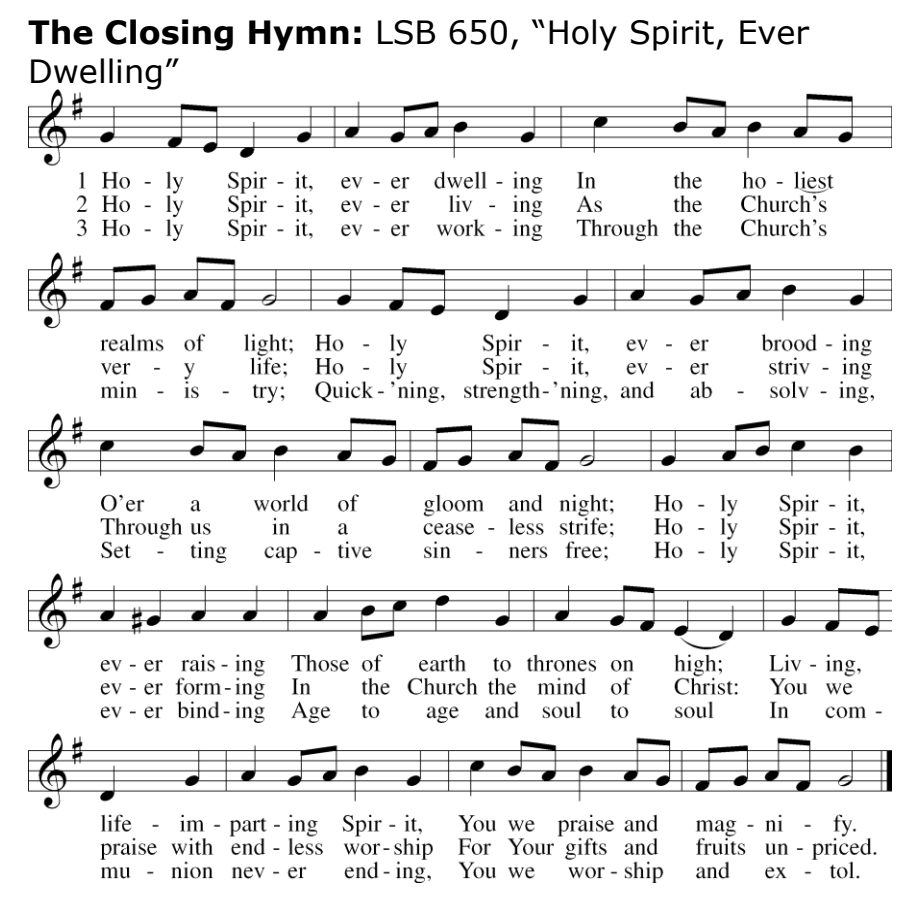
Text and tune: Public domain